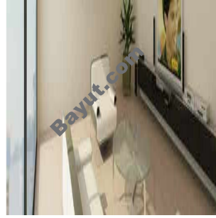
Hydra Twin Tower Lounge