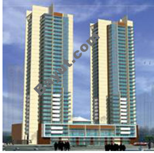
Hydra Twin Tower Exterior View 1