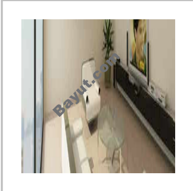
Hydra Twin Tower Lounge