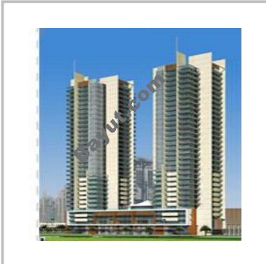
Hydra Twin Tower Exterior View 2