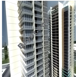
Hydra Twin Tower Exterior View 3