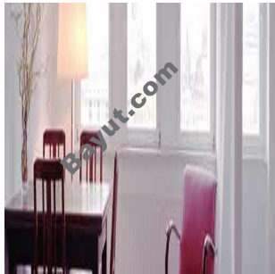
Hydra Twin Tower Living Area