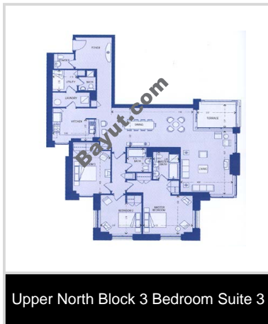
Upper North Block 3 Bedroom Suite 3