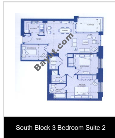
South Block 3 Bedroom Suite 2