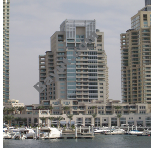
Dubai Marina Towers Anbar