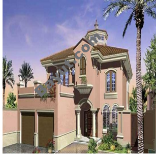
Garden Homes Exterior View