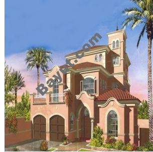
Garden Homes Exterior View 2