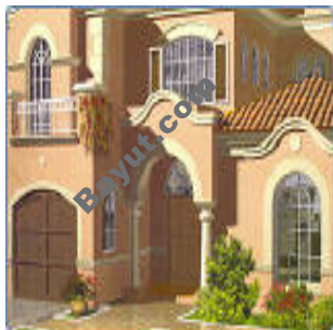
Garden Homes Exterior View 5