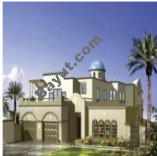
Garden Homes Exterior View 3