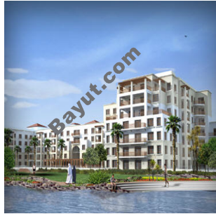
Travo Exterior View