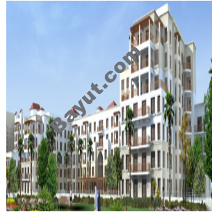
Travo Exterior View 2