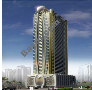
Bsel Pearl Tower