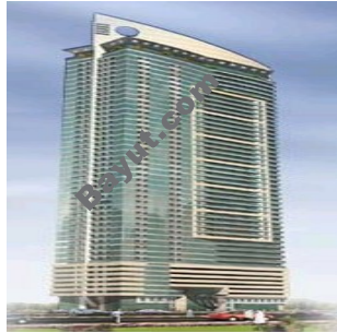
Palm Tower 3