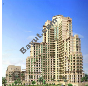
Mosela Exterior View