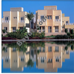
The Meadows Exterior view 1