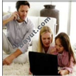
Executive Bay Living Room