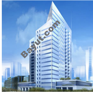
Executive Bay Exterior View