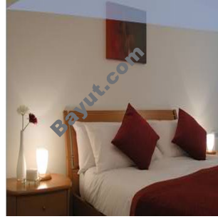
Marina Suites Bedroom