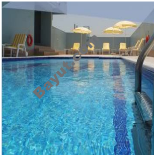
Marina Suites Swimming Pool