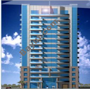
Marina Suites Exterior View