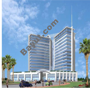
IT Plaza Exterior View