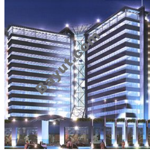
IT Plaza Exterior View 2