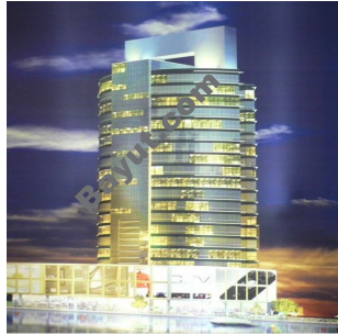
Global Bay View Exterior