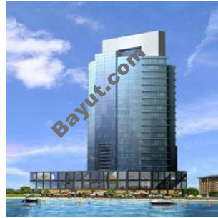
Global Bay View Exterior2