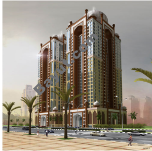
Exterior View 1