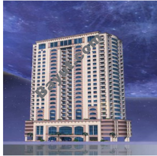
Moon Tower 2