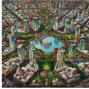
Jumierah Village South