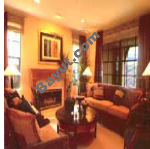
I & M Tower Drawing View