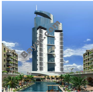
I & M Tower

For larger view click link below http://www.bayut.com/uae_dubai_offices/i_m_tower_office_for_sale-402013.html