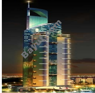
I & M Tower Exterior View