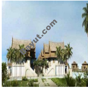
Jasmine Garden Exterior View 3