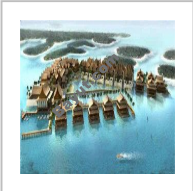
Jasmine Garden Exterior View