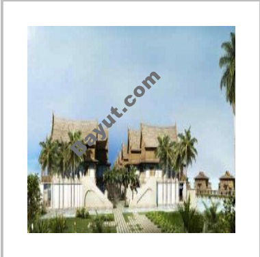
Jasmine Garden Exterior View 3