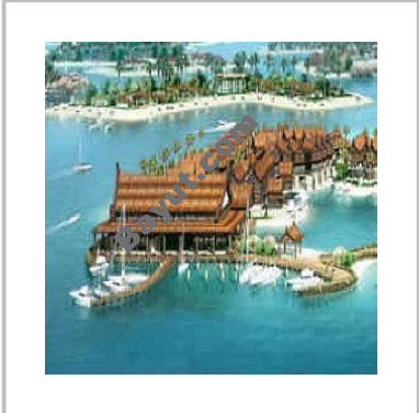
Jasmine Garden Exterior View 4

For larger view click link below http://www.bayut.com/uae_dubai_apartments/jasmine_garden_apartment_for_sale-400947.html