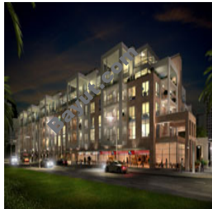
Exterior View 1