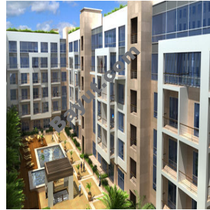
Exterior View 2