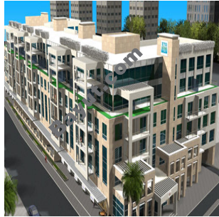
Exterior View 3