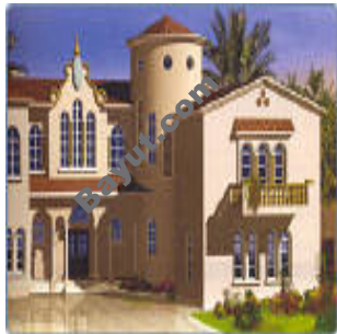
Signature Villas Exterior View 3