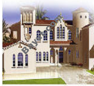
Signature Villas Exterior View 2