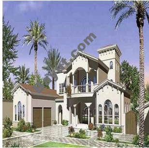
Signature Villas Exterior View