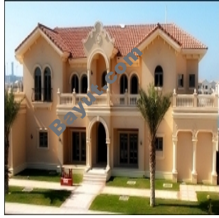
Signature Villas Exterior view