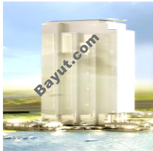
Jumeirah Business Centre 4 Exterior View