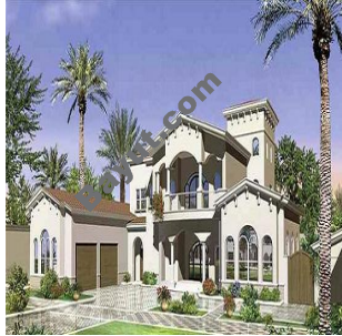
Signature Villas Exterior View