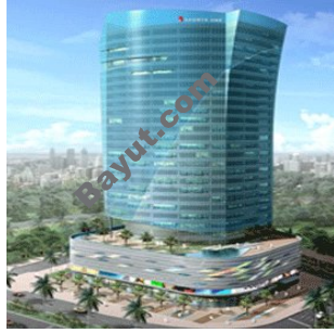
Sport One Business Tower Exterior View