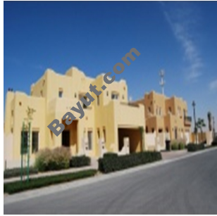
Al Reem 2, Arabian Ranches