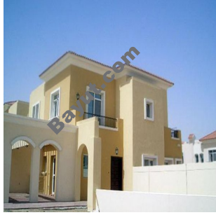
Gazelle Arabian Ranches Exterior