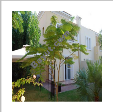
Al Reem Arabian Ranches Exterior 2