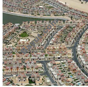
Villa For Sale