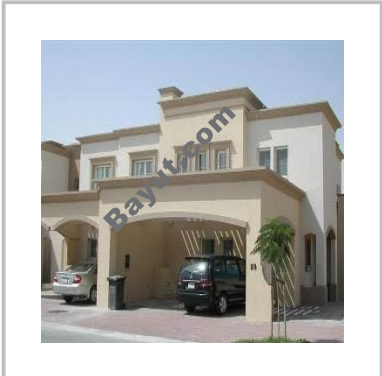
Al Reem Arabian Ranches Exterior2