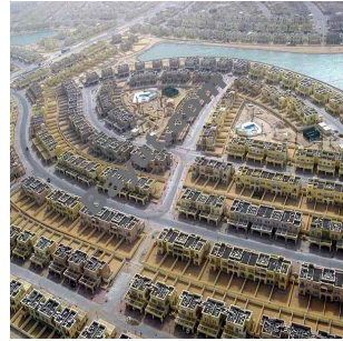
Al Reem 2, Arabian Ranches

For larger view click link below http://www.bayut.com/uae_dubai_villas/al_reem_2_bedroom_villa_is_available_for_sale-393340.html