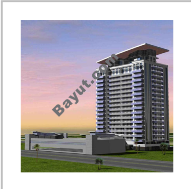
Shakespeare Tower Exterior View 2

For larger view click link below http://www.bayut.com/uae_dubai_apartments/shakespeare_tower_1_b_r_for_sale-391755.html