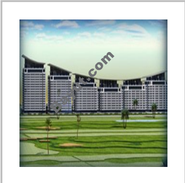
Shakespeare Tower Exterior View