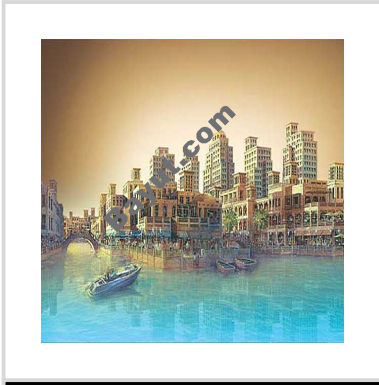
Iris Amber at Culture Village