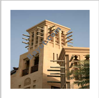
Iris Amber Exterior View 3

For larger view click link below http://www.bayut.com/uae_dubai_apartments/iris_amber_studio_for_sale_in_iris_amber_at_culture_village-391610.html