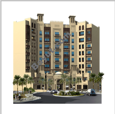
Iris Amber Exterior View 1