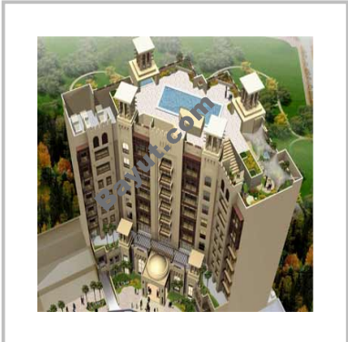
Iris Amber Exterior View 2