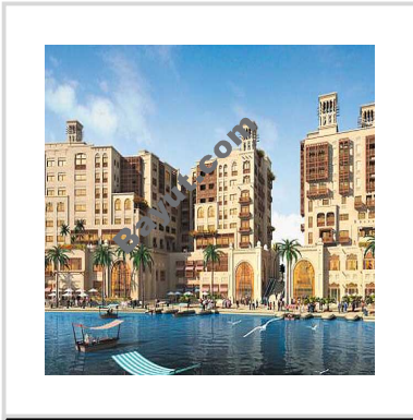
Iris Amber at Culture Village

For larger view click link below http://www.bayut.com/uae_dubai_apartments/iris_amber_studio_for_sale_in_iris_amber_at_culture_village-391610.html