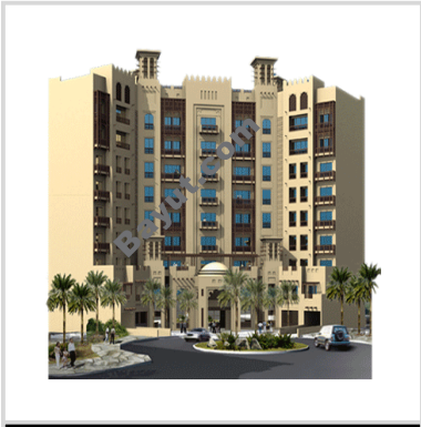
Iris Amber Exterior View 1