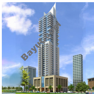
Global Royal Tower Exterior View