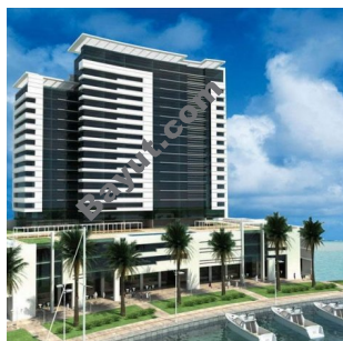
Business Central Exterior