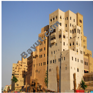
Exterior View 1