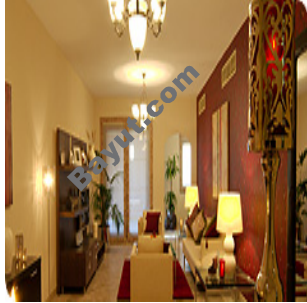
Interior View 1