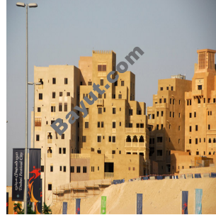
Exterior View 2