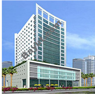
Sobha Ivory Exterior View