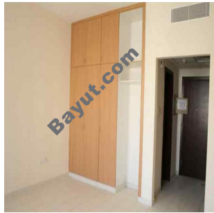
Italy Interior View