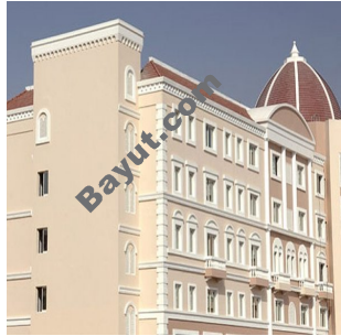
Italy Exterior View