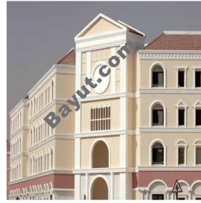
Italy Exterior View 2