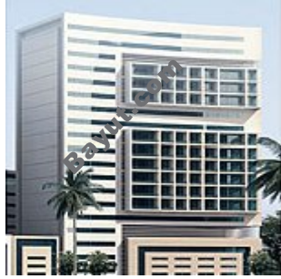
Celestial Heights Orion Exterior View