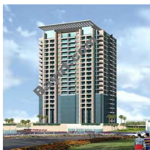
Stadium Point Exterior View