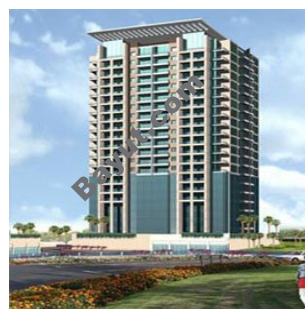
Stadium Point Exterior View 2