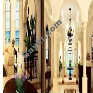
Palm Terrace Interior