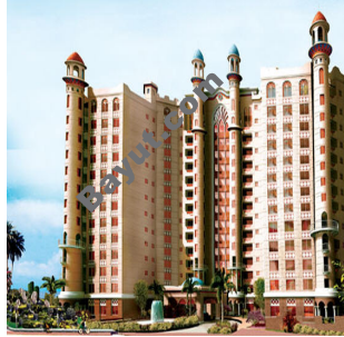
Palm Terrace Exterior View