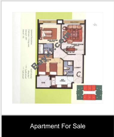
Apartment For Sale