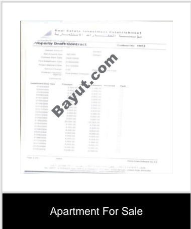
Apartment For Sale