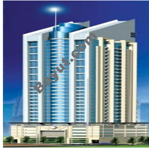
Golf Tower Exterior View 1