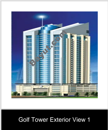
Golf Tower Exterior View 1