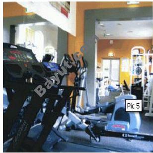
Golf Tower Fitness Club