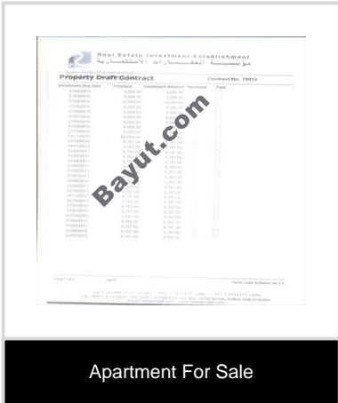
Apartment For Sale

For larger view click link below http://www.bayut.com/uae_ajman_apartments/golf_tower_ajman_apartment_for_sale-382456.html