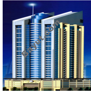
Golf Tower Exterior View 2