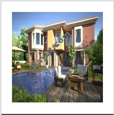
Escape Villa Semi- Detached