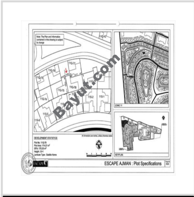
Villa For Sale