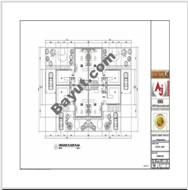
Villa For Sale