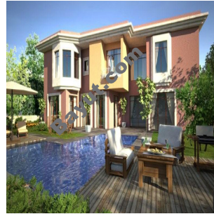
Escape Villa Semi- Detached