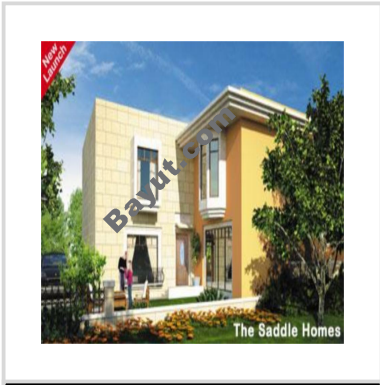
Villa For Sale