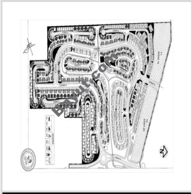
Villa For Sale