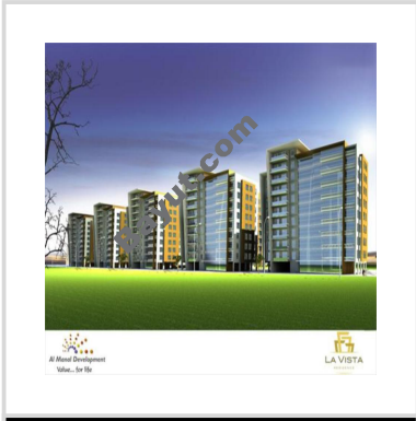
Apartment For Sale