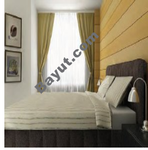
Lavista Residence Bedroom 2