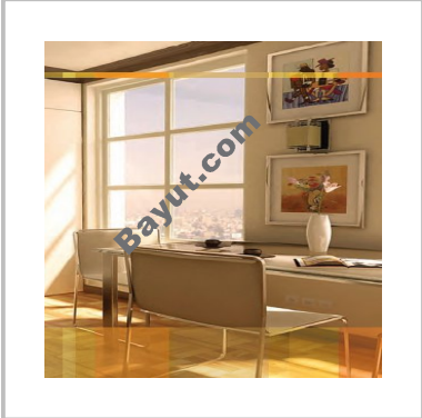
Lavista Residence Sitting Area