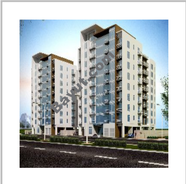
Lavista Residence Exterior View 1