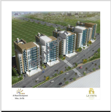
Apartment For Sale