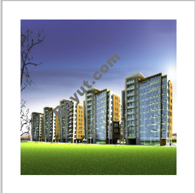
Lavista Residence Exterior View 3