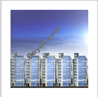
Lavista Residence Exterior View 4