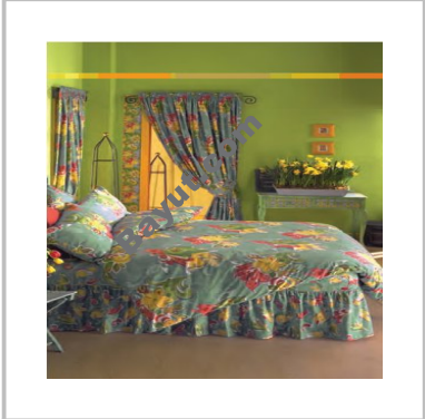
Lavista Residence Bedroom