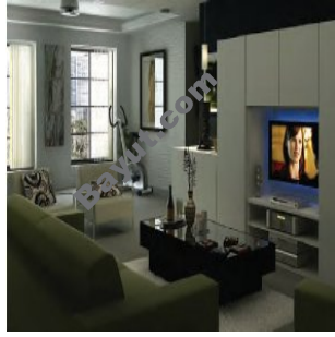
Lavista Residence TV Lounge