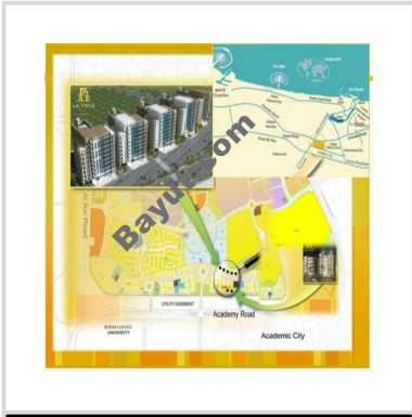
Apartment For Sale