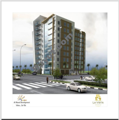
Apartment For Sale