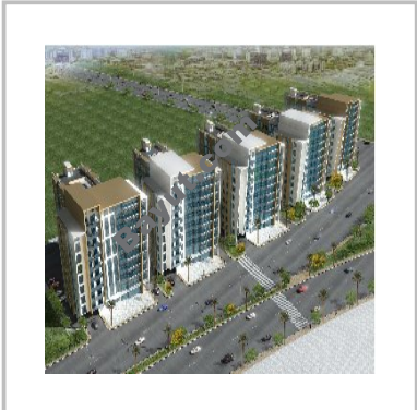
Lavista Residence Exterior View 2