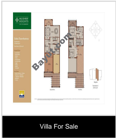
Villa For Sale

For larger view click link below http://www.bayut.com/uae_dubai_villas/sidra_townhomes_villa_for_sale-382193.html