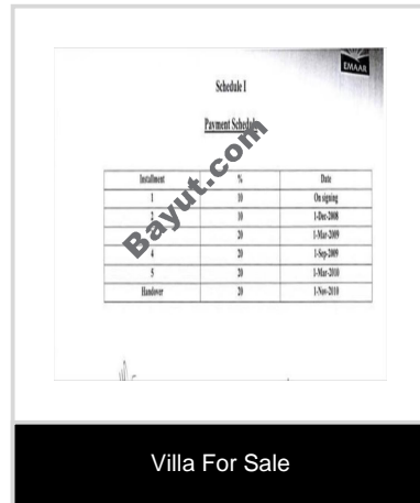
Villa For Sale