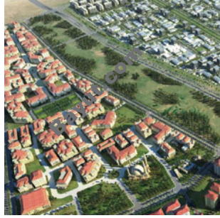
Sharjah Investment Center