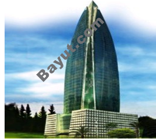
Exterior View 2