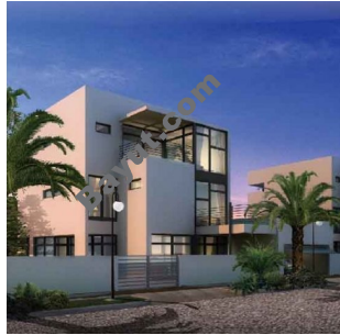
Fulva exterior view