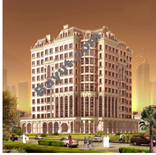
Cambridge Business Centre Exterior View