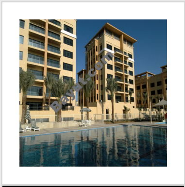
Una Riverside Residence Exterior View