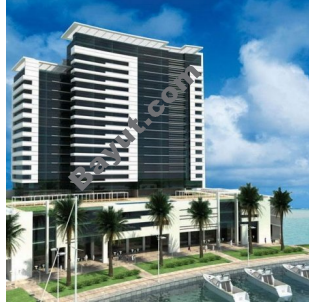
Business Central Exterior