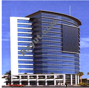
Park Avenue Exterior View