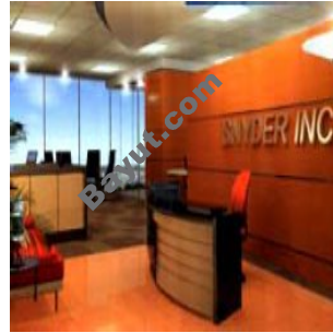
Park Avenue Interior View 1