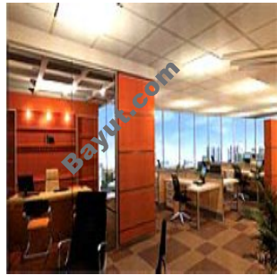
Park Avenue Interior View 2