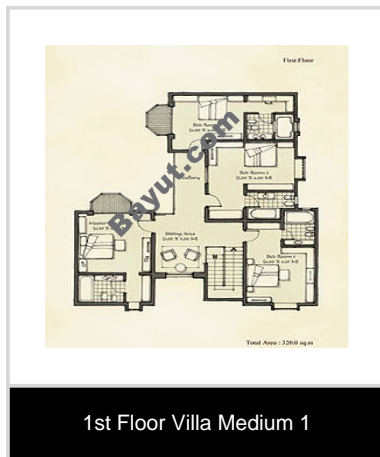
1st Floor Villa Medium 1