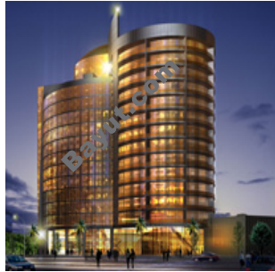
Atrium Gold Towers