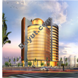
Atrium Gold Towers