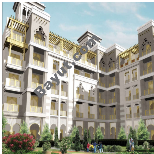
Jehaan 3 Exterior View 3

For larger view click link below http://www.bayut.com/uae_dubai_apartments/jehaan_3_studio_apartment_for_sale-368182.html