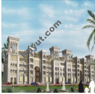
Jehaan 3 Exterior View 1