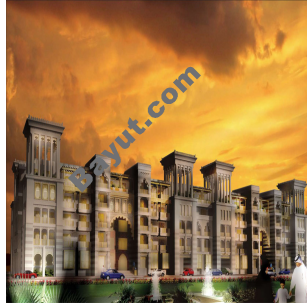
Jehaan 3 Exterior View 2