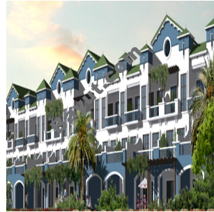
Exterior View 1