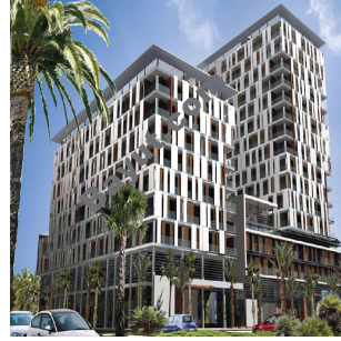
Exterior View 2