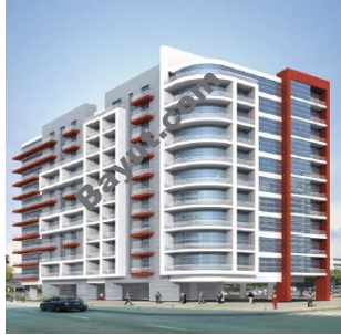
Classic Apartments Exterior View