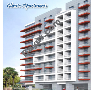
Classic Apartments Exterior View 2